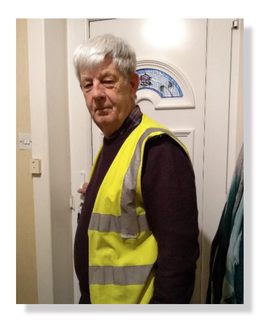
THE EDITOR SETS OFF FOR ANOTHER WEDNESDAY MORNING AT THE FOODBANK

What a difference a few months make. We are of course used to the bulk of our donations coming during the Autumn Harvest celebrations and the lead-up to Christmas, but in the latter stages of 2019 we witnessed an extraordinary degree of generosity from the people of Rochdale. I've dedicated this Newsletter to highlighting some of those individuals and organisations who have helped us so much but it's worth setting out some overall figures.